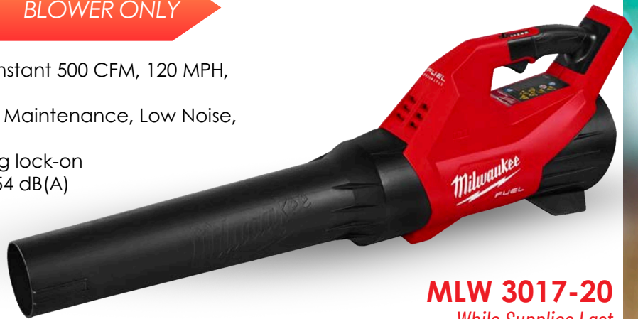
MLW 3017-20 While Supplies Last

Super Lightweight High Output Lithium-ion